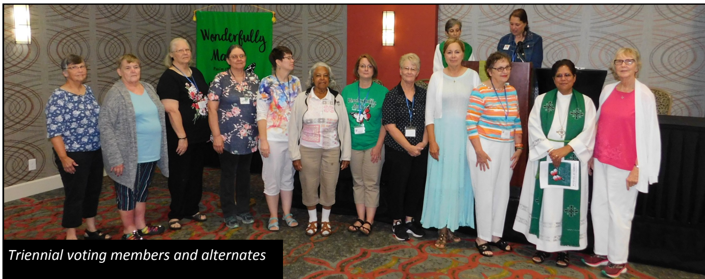
Triennial voting members and alternates